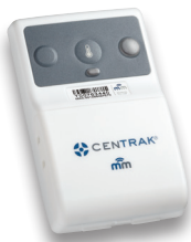
Liquid Nitrogen Sensor