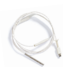
LT & LN Probe