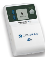
Ultra-Low Temperature Sensor