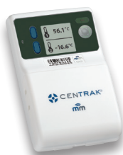
Temperature Only Sensor