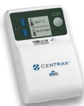
Ambient Humidity Sensor