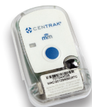
Multi-Mode Asset Tag