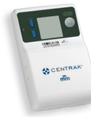
Environmental Sensor LCD